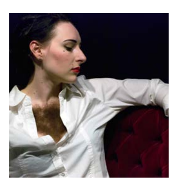
INVITED POSTGRADUATE STUDENTS