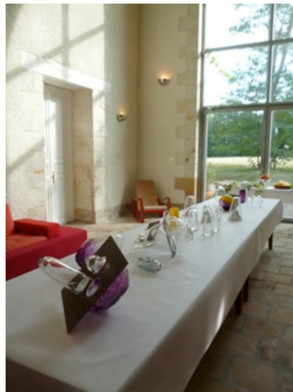
Liquid Fusion 2013 Final Presentation Display ; The Clock Room

For further information on the 'Glass is Tomorrow' programme see : http://www.glassistomorrow.eu