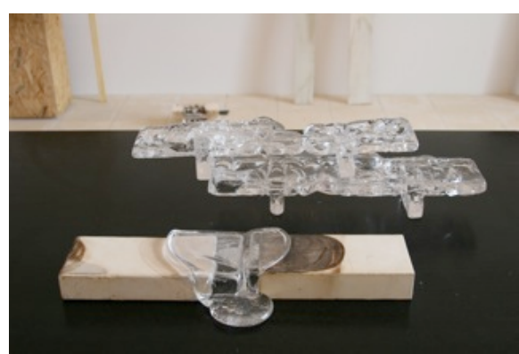
Liquid Fusion 2013 Final Presentation Display : Stephane Halmaï-Voisard, Mortar Memory